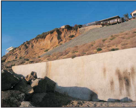
Character Sample Wall F : Poorly designed massive wall that does not relate to its setting