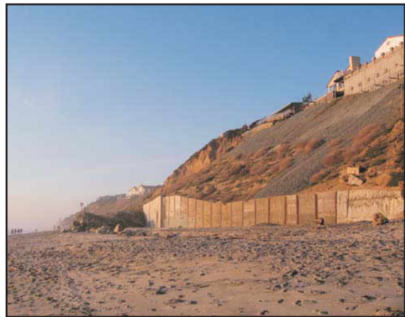
Character Sample Wall K : No attempt was made to fit these walls into the forms, material and color of the adjacent area