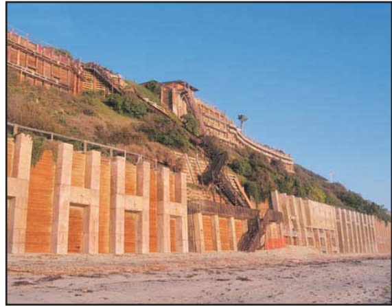
Character Sample Wall G : This wall form has been repeated across several properties