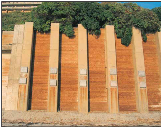
Character Sample Wall J : Though not a natural looking wall, this design treatment provides variation in color, texture and shadow patterns