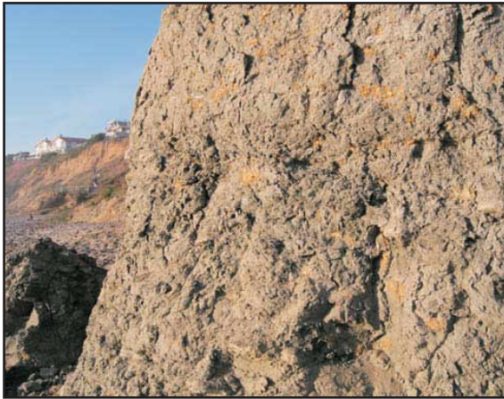
Character Sample Rock G Heavier texture than most other rock outcrops in area