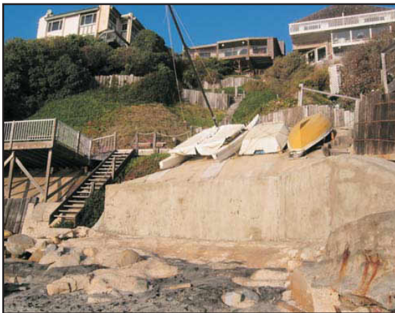
Character Sample Wall B Wall relates well to rock in sand