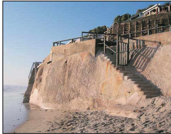
Character Sample Wall A Rounded forms, but still clearly man-made