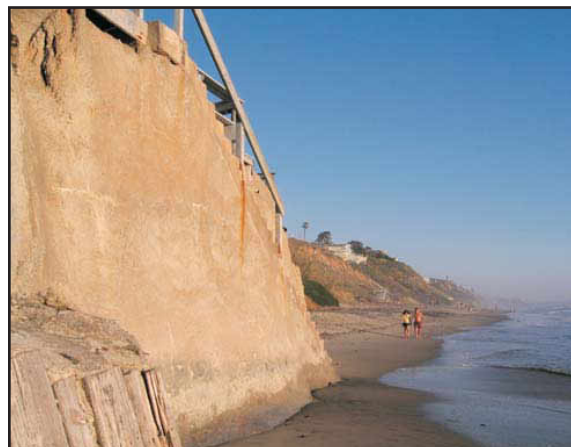
Character Sample Wall E : Because of its far westerly position, this wall is very visible but has a more natural landform and texture than most others