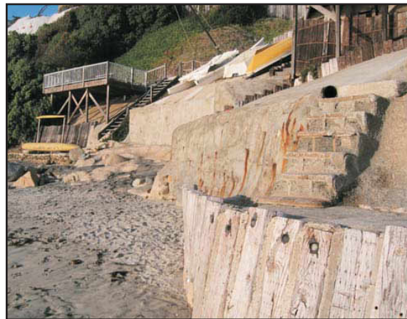
Character Sample Wall C : Too many materials and forms along this section of the wall