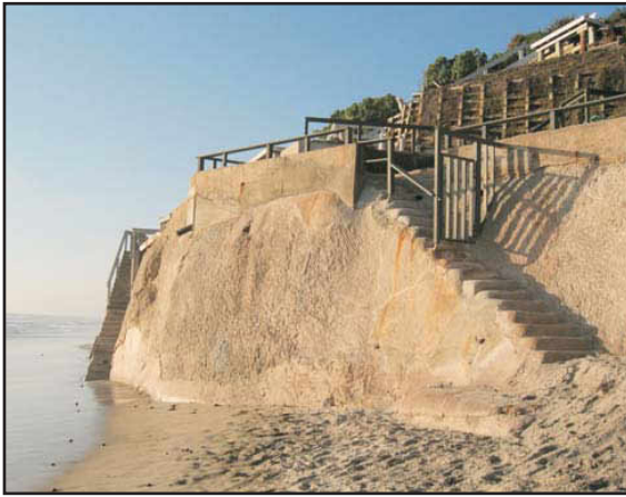
Visual Character Unit 4 North Bluff with Retaining Walls