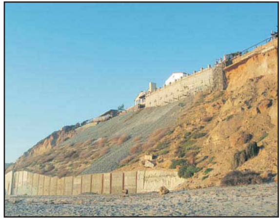
Visual Character Unit 7 South Bluff with Retaining Walls