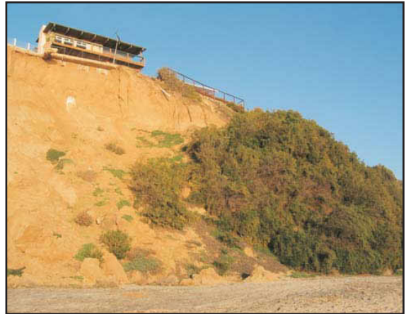
Visual Character Unit 9 South Revegetated Bluff