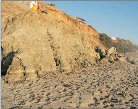
Visual Character Unit 8 South Bluff Failure / Beach Erosion Deposit