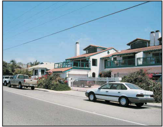
Visual Character Unit 5 Adjacent Neighborhood